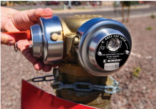
Knox FDC Lock with Swivel-Guard™ locked onto siamese connection