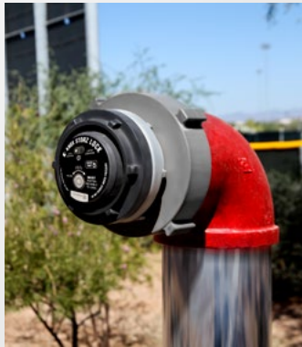
Knox Storz Lock secured onto a large FDC