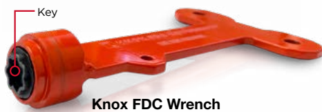
Knox FDC Wrench