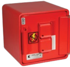
Dual Lock Surface Mount