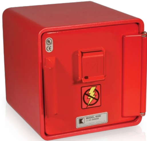
Single Lock, Surface Mount

The Knox Remote Power Box enables emergency responders to rapidly power down a building before entering. Designed to remotely operate the building's shunt switch, the Knox Remote Power Box supports electrical power disconnect for not only buildings, but also equipment and systems such as generators, power distribution, wind, solar power and telecommunications systems.