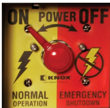
Lockout/Tagout Posts Accommodate a Tamper Seal