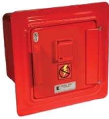
Single Lock Recess Mount